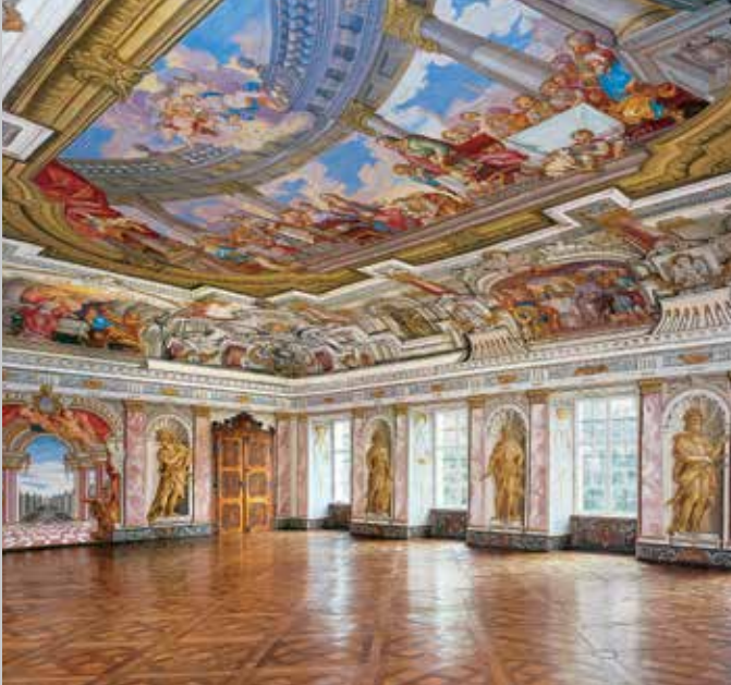
Baroque Imperial Hall with illusionistic wall and ceiling painting by Benedikt Albrecht (above); Detail of a door panel in the Imperial Hall (below)