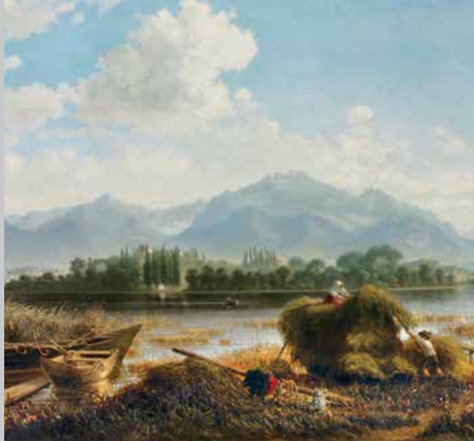
View of Herrenchiemsee from the old crossing point at Urfahrn which was also used by Ludwig II, painting by the 'Chiemsee artist' Albin Mattenheimer, 1874

With all their original frescos and furnishings, they are among the most outstanding residential interiors from the Baroque period in Germany. In the Convent Tract (east tract) the Library Hall was designed by the well-known artist Johann Baptist Zimmermann in around 1740. Museums were set up in both tracts in 1998. The Constitution Museum commemorates the historic conference held in these rooms in 1948 to prepare the constitution of the Federal Republic of Germany, one of the most important and promising chapters in the history of modern democracy. Further rooms record the rich history of the oldest monastery in Bavaria, and the cathedral chapter. The former apartment of Ludwig II is exactly as it was during his lifetime.