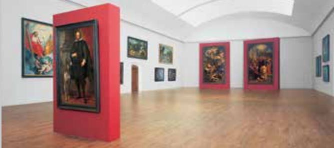
Main room in the State Gallery with Rubens altars