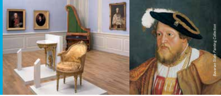
Pfalz-Neuburg museum (l.); Count Palatine Ottheinrich (r.)

Dr. Markus Söder, MdL Bayerischer Staatsminister der Finanzen, für Landesentwicklung und Heimat