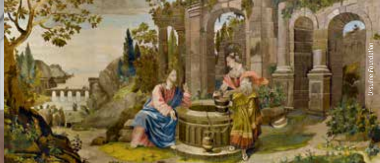
'Jesus and the Samaritan Woman', altar antependium