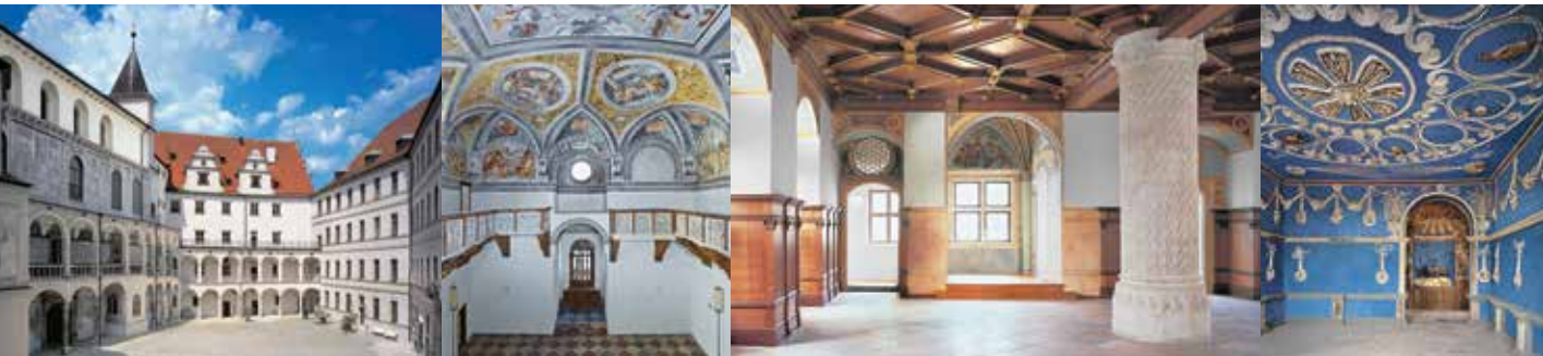
Porcelain cup with a Portrait of Duchess Maria Amalia (top); Renaissance Knights' Hall (l.); Baroque palace grottos (r.)