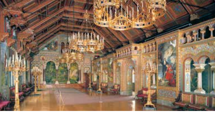
The Singers' Hall on the fourth floor of the castle

Dr. Markus Söder, MdL Bavarian Minister of State of Finance, Regional Development and Regional Identity