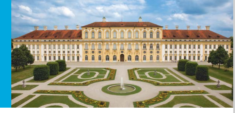
Schleissheim New Palace

Bayerischer Staatsminister der Finanzen und für Heimat