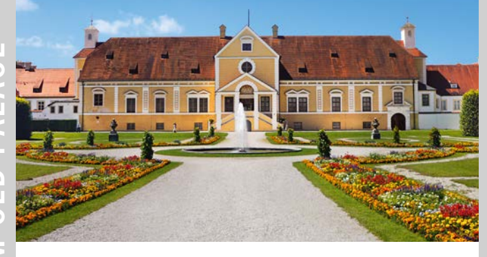
Schleissheim Old Palace