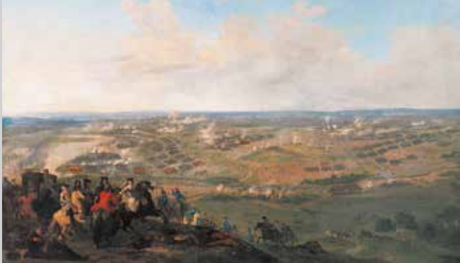
The Battle of Blenheim, Huchtenburgh, after 1704