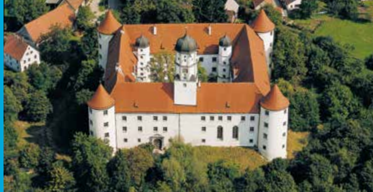
Aerial photo of Höchstadt Palace

Bayerischer Staatsminister der Finanzen, für Landesentwicklung und Heimat