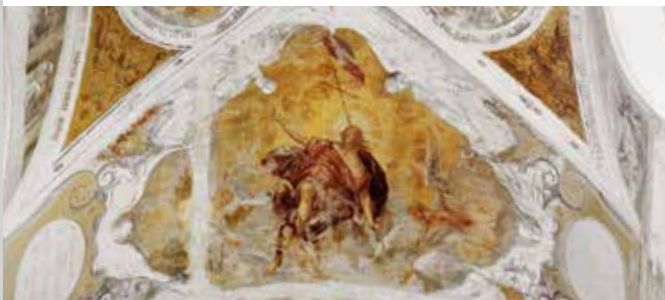
Ceiling fresco in the Palace Chapel

Höchstadt Palace is one of the outstanding monuments of the former Principality of the Palatinate-Neuburg. It was built following the marriage of Philipp Ludwig, Count Palatine of Neuburg, to Anna of Cleves (daughter of the Duke of Jülich-Cleves-Berg) in 1574. In the marriage settlement, the Count Palatine agreed to build an appropriate dowager's residence for his spouse. In 1589–1602, masons from the canton of Grisons in Switzerland erected the new building in late Renaissance style, based on designs by Lienhart Grieneisen and incorporating the Gothic tower of the earlier castle. Duchess Anna lived as a widow in Höchstadt from 1615 to 1632. Although her son Wolfgang Wilhelm enforced the Counter-Reformation in Neuburg for political reasons, she continued to hold fast to the Protestant faith in the Palace – as can still be seen from the fresco paintings in the vaulting of the Palace Chapel, which are among the finest artistic achievements of southern German Protestantism before the Counter-Reformation. After 1632, the Palace was only used for less important purposes, so that much of the original appearance of a late Renaissance princely residence has survived.