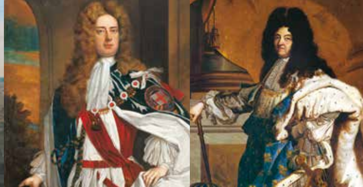
Duke of Marlborough (left); King Louis XIV (right)