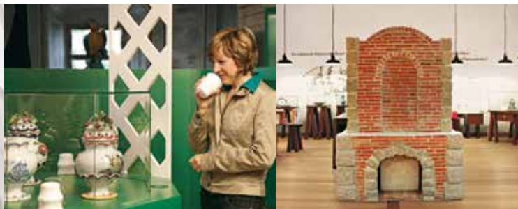
Exhibition rooms in the Museum of German Faience

There is information about the manufactories' production methods and the items they made, and the importance of faience for the dining style and domestic décor of the period is explained. Visitors can appreciate why faience was so widely used and valued at that time. What is faience and how is it manufactured? Answers are available all round a replica kiln. Other faience items are presented in the settings in which they were originally used – for example, on a magnificently laid banquet table and in the display kitchen, with crockery and original cooking recipes. Children and adults can join in – there are entertaining and sensory elements and demonstrations that encourage careful inspection and experimentation.