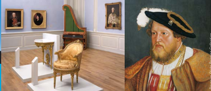
Pfalz-Neuburg museum (l.); Count Palatine Ottheinrich (r.)