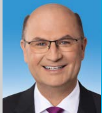
Albert Füracker, MdL State Minister

We wish you a fascinating visit to Neuburg Palace!