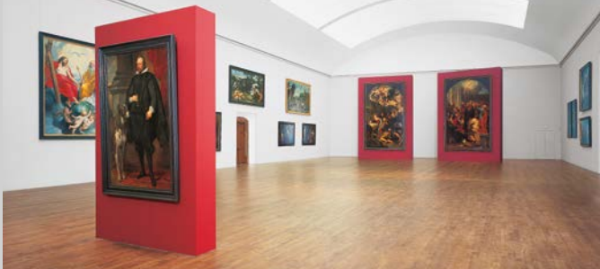
Main room in the State Gallery with Rubens altars