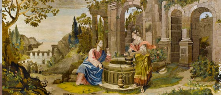
'Jesus and the Samaritan Woman', altar antependium