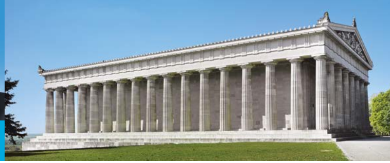
The Walhalla from the east