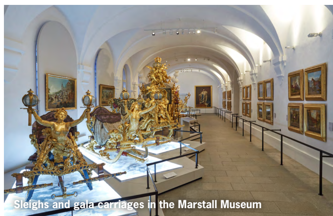
Sleighs and gala carriages in the Marstall Museum