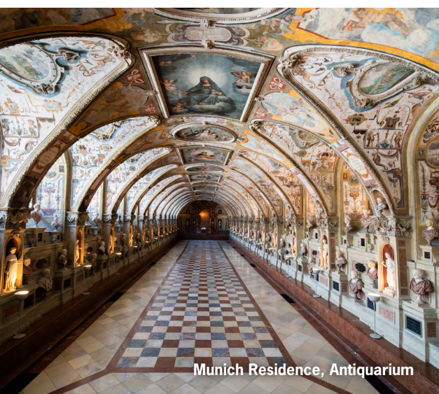
Munich Residence, Antiquarium