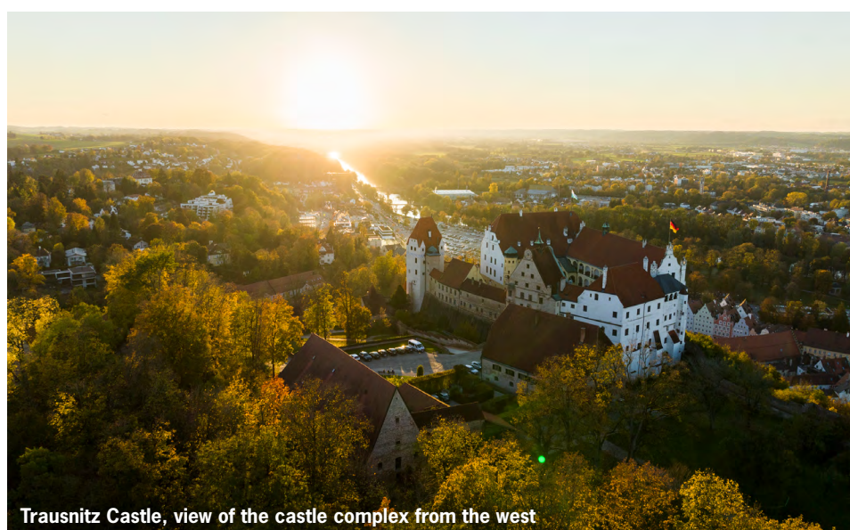
Trausnitz Castle, view of the castle complex from the west