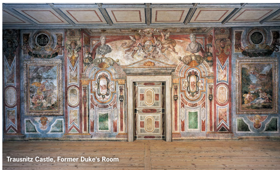
Trausnitz Castle, Former Duke's Room