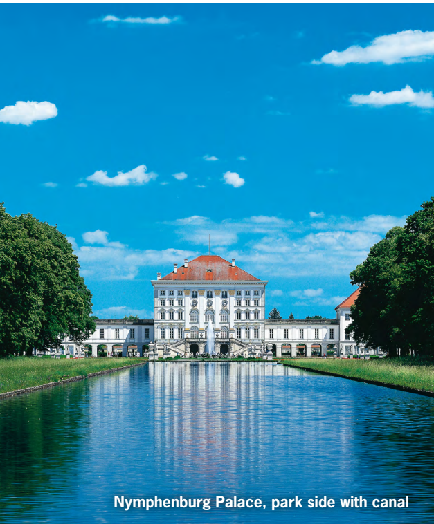
Nymphenburg Palace, park side with canal