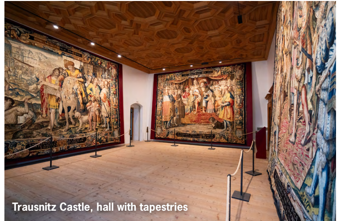
Trausnitz Castle, hall with tapestries