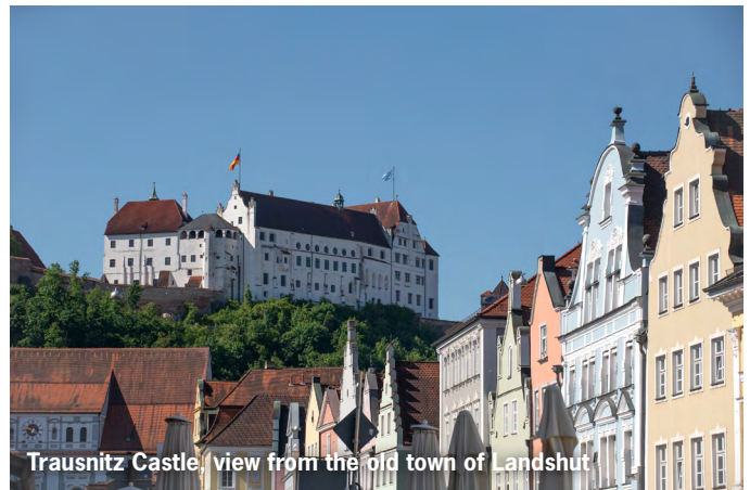
Trausnitz Castle, view from the old town of Landshut