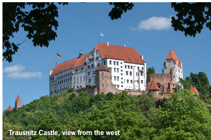
Trausnitz Castle, view from the west