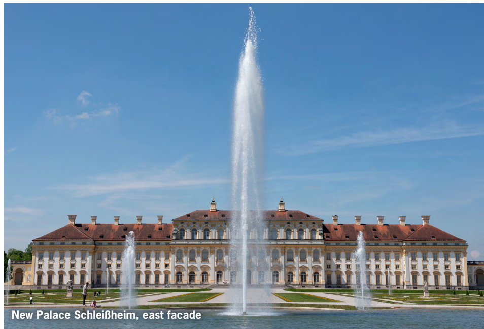
New Palace Schleißheim, east facade