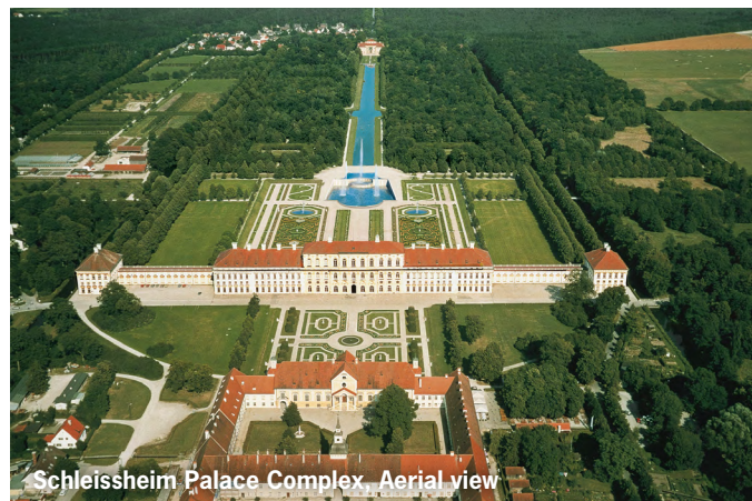
Schleissheim Palace Complex, Aerial view

The palace complex of Schleissheim is one of the most important Baroque complexes in Germany. It was built for the Bavarian dukes and electors as a summer residence and consists of the Old Palace, New Palace and former hunting lodge Lustheim. Splendid architecture, valuable paintings and other treasures are on display inside the palace and the court garden is a treat for garden and nature lovers. With its artistically designed water features, including impressive fountains and a magnificent cascade, it is one of the best preserved Baroque gardens in Europe.