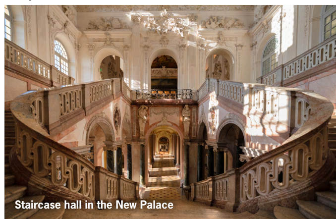
Staircase hall in the New Palace