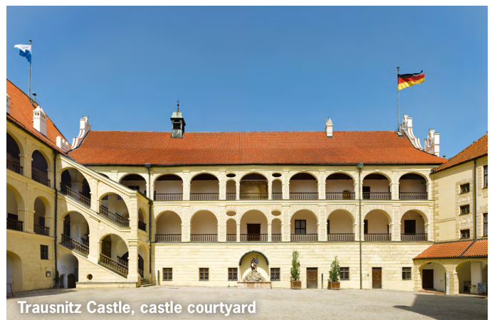
Trausnitz Castle, castle courtyard