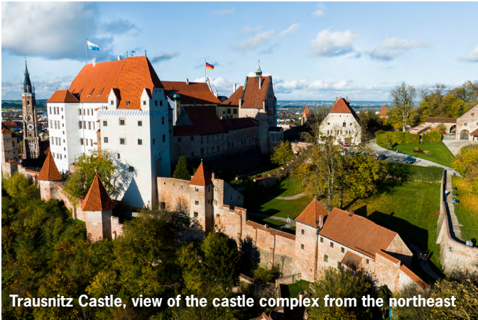
Trausnitz Castle, view of the castle complex from the northeast

The ancestral castle of the Wittelsbachs, which was founded in 1204, was the residence of the Lower Bavarian dukes from 1255 – 1503 and subsequently the court of the Bavarian crown princes. Notable features of the medieval castle are the impressive fortifications, the high Wittelsbach Tower and the castle chapel with its important sculptures and altars. The pergolas in the castle courtyard, the paintings of the Commedia dell'Arte in the Fools' Staircase and the tiled stoves, tapestries and furniture of the residential rooms date back to the Renaissance. The 'Kunst- und Wunderkammer' (Chamber of Art and Curiosities) contains 750 exhibits including works of art, treasures from the Orient and curiosities typical of the art collections owned by rulers in the Renaissance era.